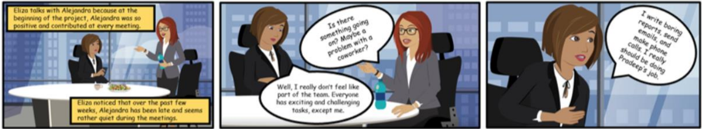
Example of a Comic Strip on the Exam

Animation video: For animation video items, candidates will watch the animation video. Candidates can watch the animation multiple times and use the video controls to start, stop, rewind, etc. Based on the scenario, the candidate will be presented with a multiple-choice question to answer. Candidates will receive headphones at the testing center. The animations will have audio and will also include closed captioning.