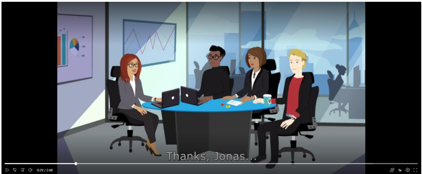
Example of an Animation Video on the Exam

Enhanced Matching: For most enhanced matching (drag and drop) items, candidates will see two columns of boxes. They will be given a scenario and will need to match the boxes on the left with the boxes on the right (opposite for Arabic candidates). They will simply click and drag one of the boxes on the left-hand side and place it on the appropriate box on the right-hand side. They will do this for all the boxes in the left-hand column.